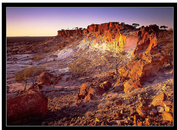
October's Photo of the Month – "Painted Cliffs"

Following last month's Photo of the Month from Canada ("Serenity"), I felt compelled to make October's photo a local one. You read the story of "Painted Cliffs" last month, so I won't rehash it. Suffice to say I love the shot, so it's now October's Photo of the Month.