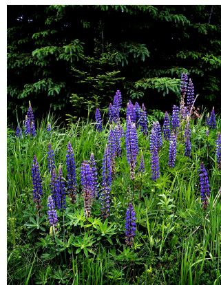
Lupins in Ontario, Canada